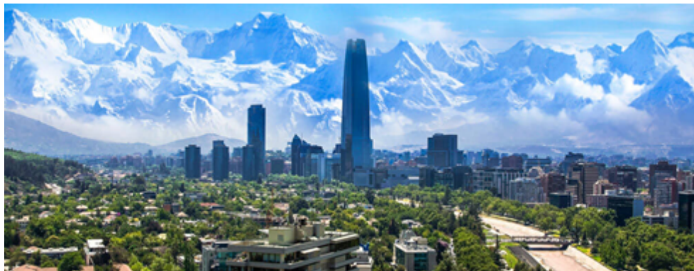
Santiago's neuralgic center on a winter day The imposing Andes Mountains can be seen on its eastern border.