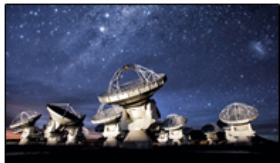
The ALMA (Atacama Large Millimeter/submillimeter Array) radio telescope is the largest astronomical project in the world, the result of an international effort based on Chilean territory.